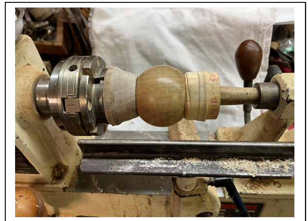
Demo – turning a sphere