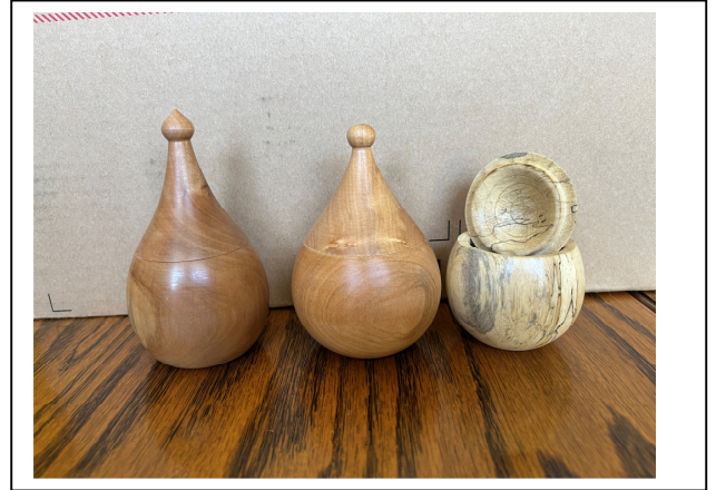
Ted's Demo – Tear Drop Box