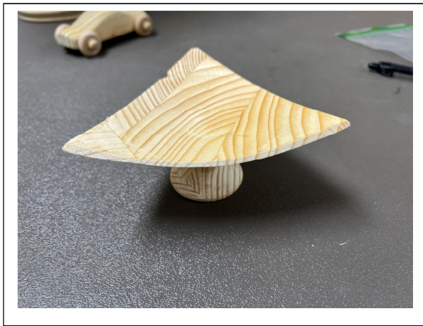
Demo – 3 point bowls