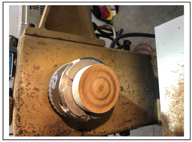
Texturing - Demo piece.