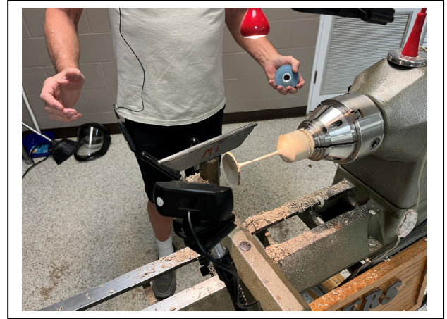
Demo - Podlet