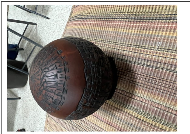
Al Hockenbery - Demo