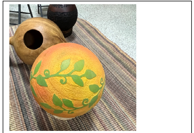
Al Hockenbery - Demo