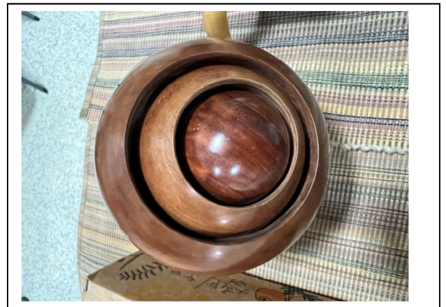
Al Hockenbery - Demo