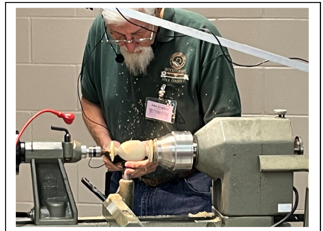
Demo – turning a egg box