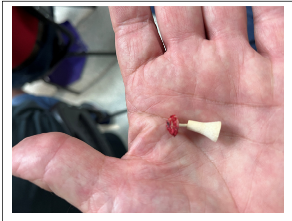
Demo – Flower and Vase