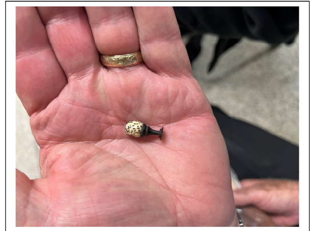
Two part Goblet