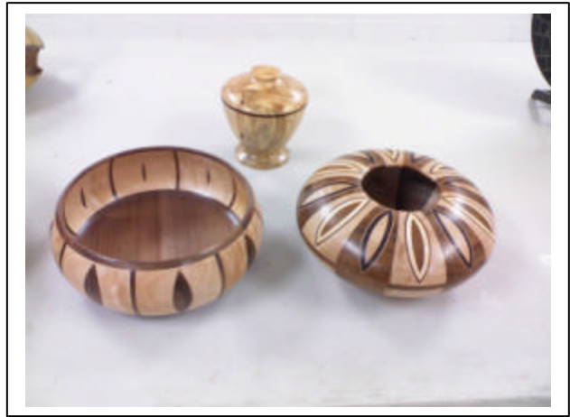
Keith's Segmented vessels and box