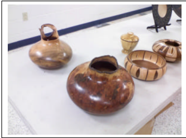
Al's Hollow forms.