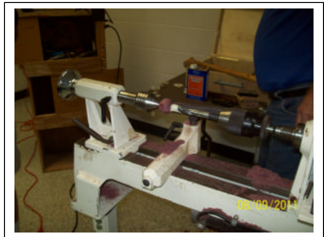
Turning inside ball (chucked on drill bit.)