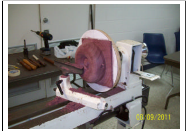
Turning one side – block hot glued on at edges.