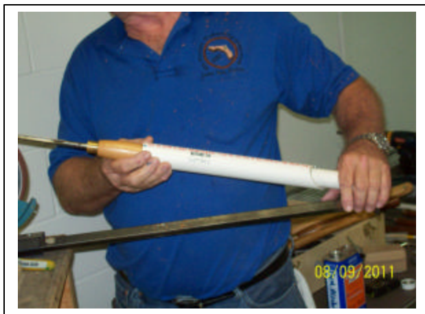
PVC Pipe cut at 45° to sharpen detail gouge.