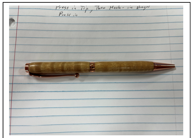
Final work – Maple pen